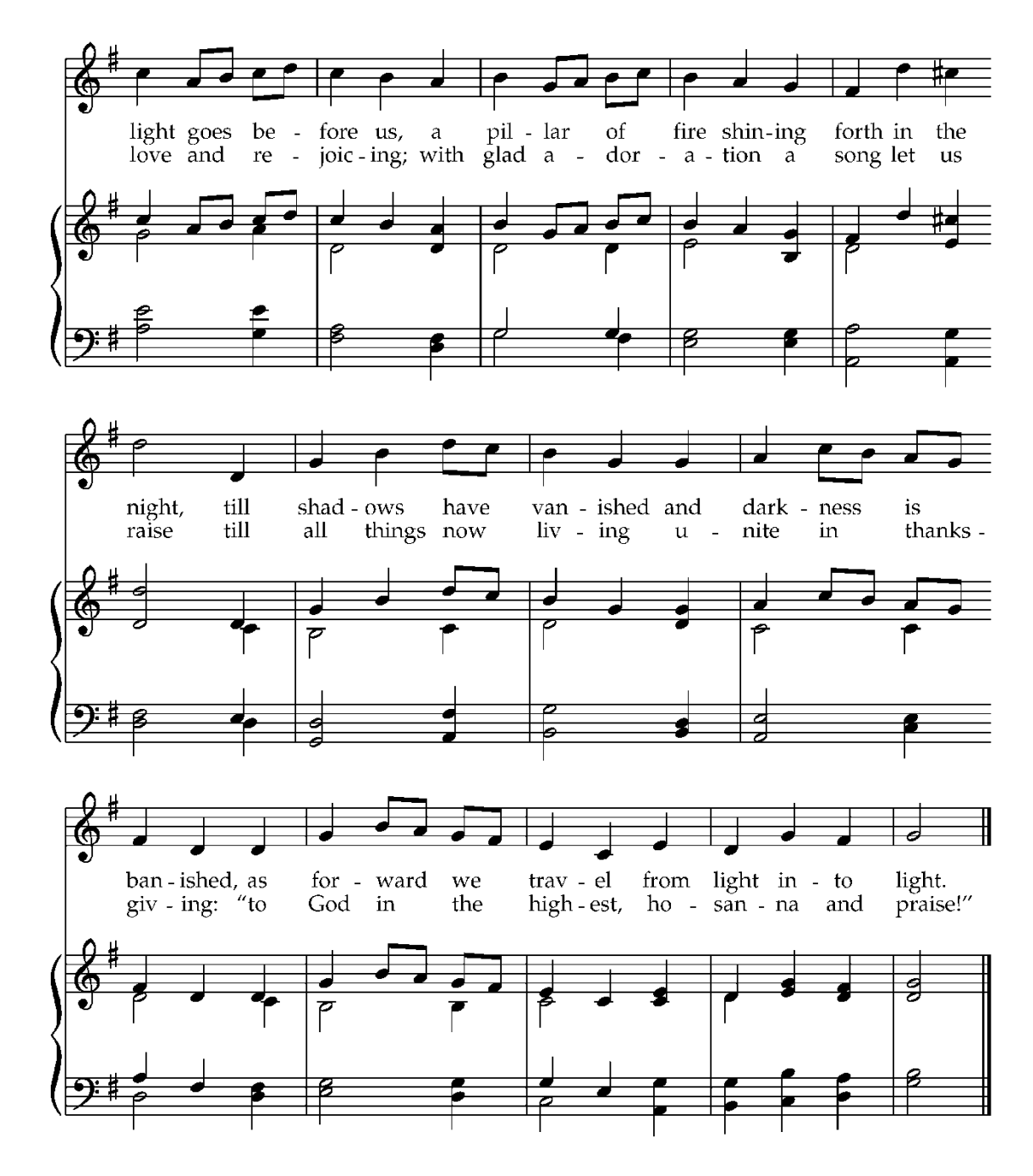
We Go Forth in the Name of God